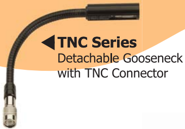
◀ TNC Series Detachable Gooseneck with TNC Connector