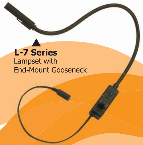
▲ L-7 Series Lampset with End-Mount Gooseneck