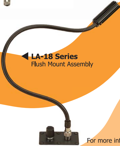
◀ LA-18 Series Flush Mount Assembly